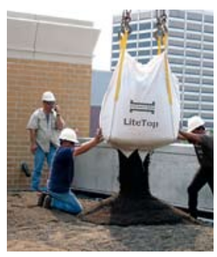
Growing media being distributed on the rooftop.