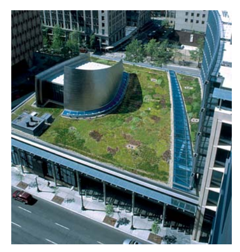
In addition to providing pleasing open spaces, the combined benefits of garden roofs (Seattle City Hall, above) offer particular advantages to municipal governments, such as sustainability, extended durability of a roof's waterproofing membrane, moderating temperatures (thus reducing energy demand), and improved acoustic insulation. But their greatest benefit, particularly for the City of Seattle, is in the dramatic reduction in storm water runoff.

Although it would comprise only 39 percent of the cumulative total roof surface, and therefore would not qualify for LEED points, the city ultimately supported the inclusion of a green roof for aesthetics and as highly visible evidence of its commitment to sustainability.