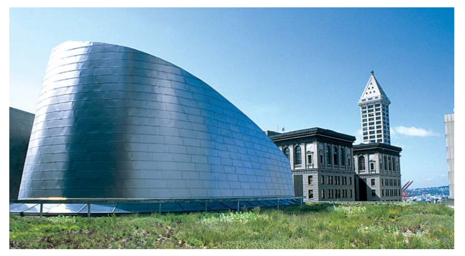
Lush grass and succulents surround a gleaming, titanium-clad Council Chamber atop Seattle's new City Hall, creating an evolving garden roofscape as plants change color with the seasons and the reflective metal changes visual qualities in varying daylight conditions.