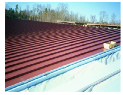
Figure 4: Standing Seam Metal Roofing (SSMR) Assemblies

Using Styrofoam™ Brand XPS Foam Insulation in conventional, PMR and SSMR systems provides the owner with proven, durable, and energy-efficient constructions. Depending on the type of roof assembly and the sequence of its installation in areas of a roof where excessive temperatures are possible, use of the precautions in this document will help ensure that these assemblies are installed without damaging the insulation − a key element to the thermal efficiency of this part of the building envelope.