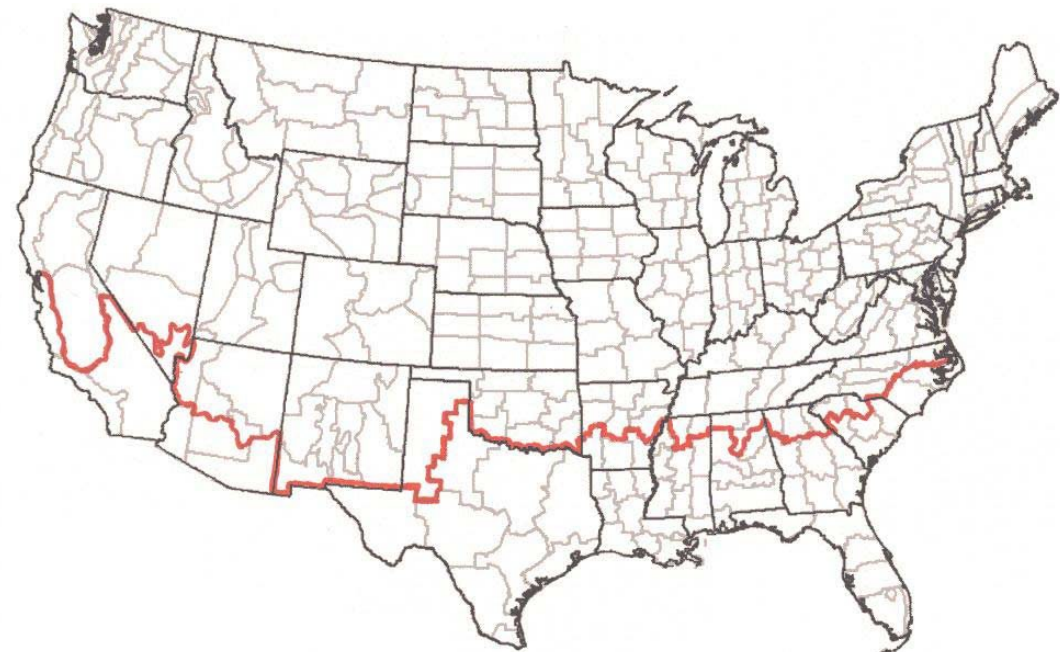
Reproduced from NOAA Climatography of the United States No. 85, June 2002. Climate divisions shown represent regions within a state that are as climatically homogeneous as possible. Divisional boundaries generally coincide with county boundaries except in the western U.S., where they are based largely on drainage basins.

The map below provides the approximate 3,000 HDD line. Therefore, any project that is located south of this line would not require an air space between the foam and any topping material. Any project located north of the line would require the air space in diffusion closed conditions in order to be considered for a thermal warranty.