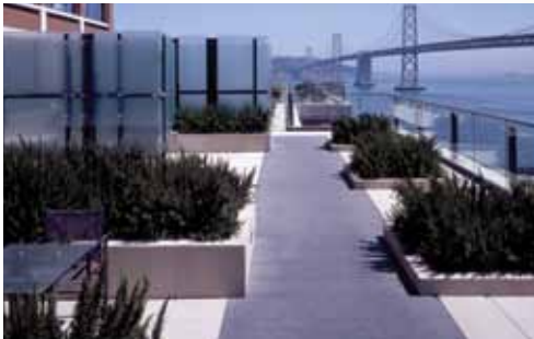
Gap Headquarters - San Francisco, CA