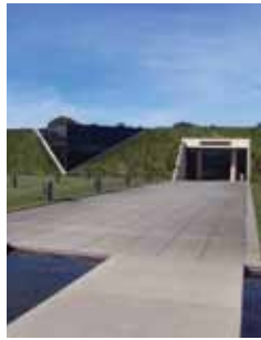
Artesa Winery - Napa, CA