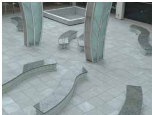
SEPTA Station – Philadelphia, PA