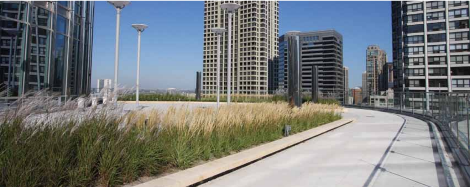
Trump International Hotel & Tower – Chicago, IL

Please contact Hydrotech for specific warranty terms and conditions.