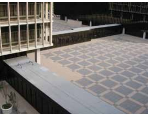
American General - Houston, TX

Installation Flexibility - pavers are set directly on spacer tabs or adjustable pedestals to an established grade and even leveled where a sloped deck exists – a simple, durable solution.