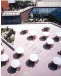
Cavalry Hospital - Bronx, NY