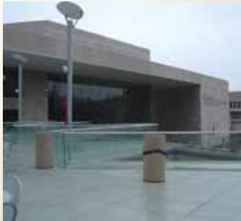
Constitution Center - Philadelphia, PA

Much has changed in our industry since I began my career over 40 years ago, but the values that underpin our success have not: integrity, quality, trust, accountability and relationships based on respect for each other. At American Hydrotech we have talented and energetic people who have a passion for their work and who are committed to providing value at a fair price.